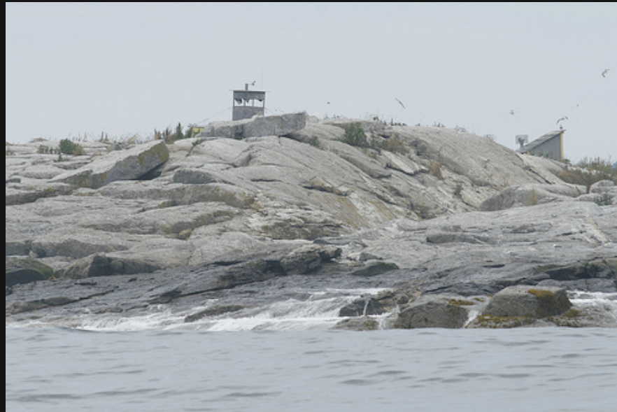
EASTERN EGG ROCK ISLAND: MAINE