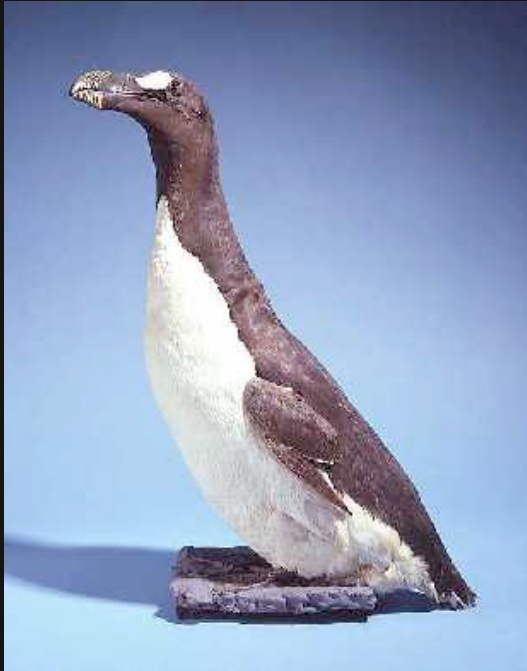
THE GREAT AUK