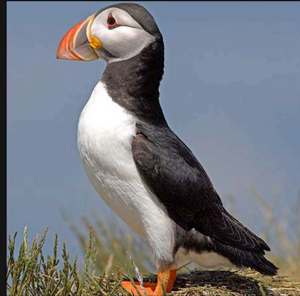
THE NORTH ATLANTIC PUFFIN