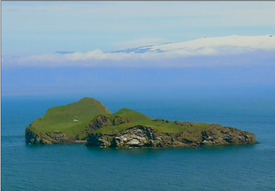
WESTMANN ISLANDS: ICELAND