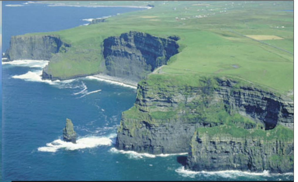
CLIFFS OF MOHER: IRELAND