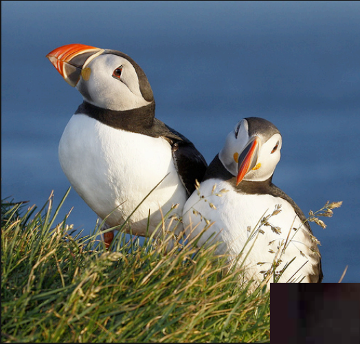
THE NORTH ATLANTIC PUFFIN