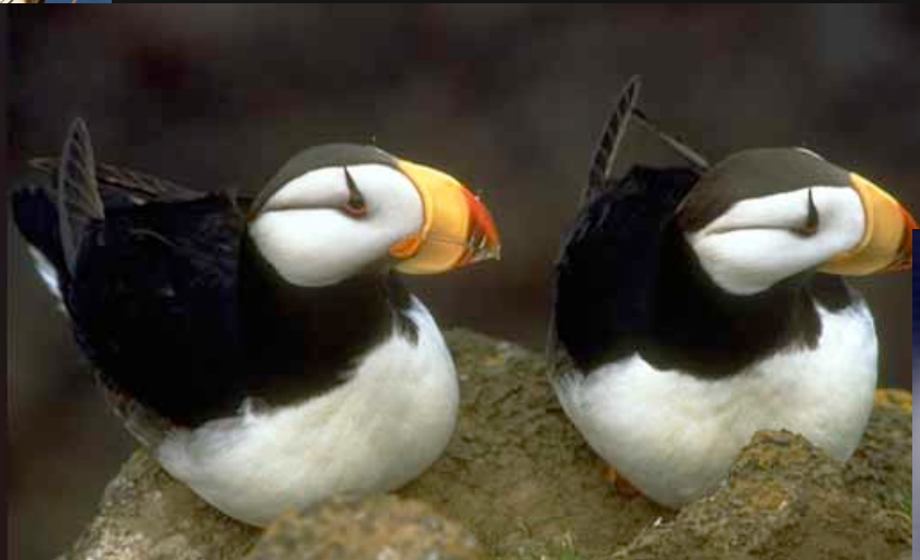
THE HORNED PUFFIN